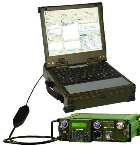
Figure 1. Military laptop connected to a tactical radio using the ACC-188.

The heart of the design is an 8-bit microcontroller with integrated USB port and a Field Programmable Gate Array (FPGA) device. Considering that the USB port on the host computer fully powers the ACC-188, the design is optimized to consume less than 0.3 watts of power to minimize battery drain when used with laptops operating off of battery. This feature is vitally important in battlefield situations where soldiers may not have the ability to recharge their laptop batteries for extended periods of time.